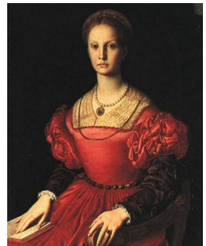
Figure 7 Elizabeth Bathory