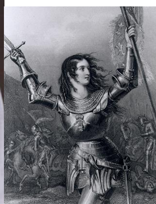
Figure 10 Jehanne D'Arc