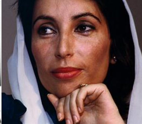
Figure 9 Benazir Bhutto