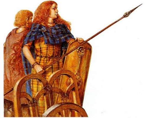
Figure 5 Boudicca