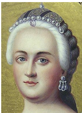
Figure 3 Catherine the Great