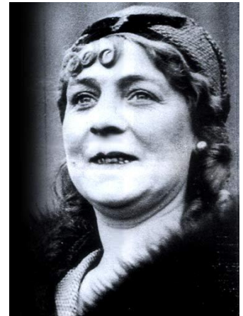
Figure 6 Tilly Devine