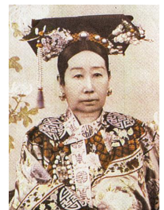
Figure 4 Cixi