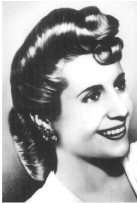
Figure 8 Eva Peron