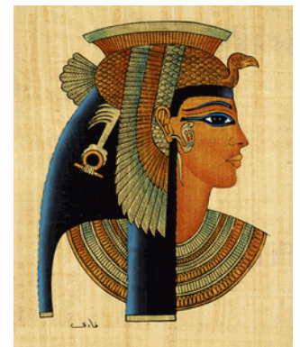
Figure 2 Cleopatra